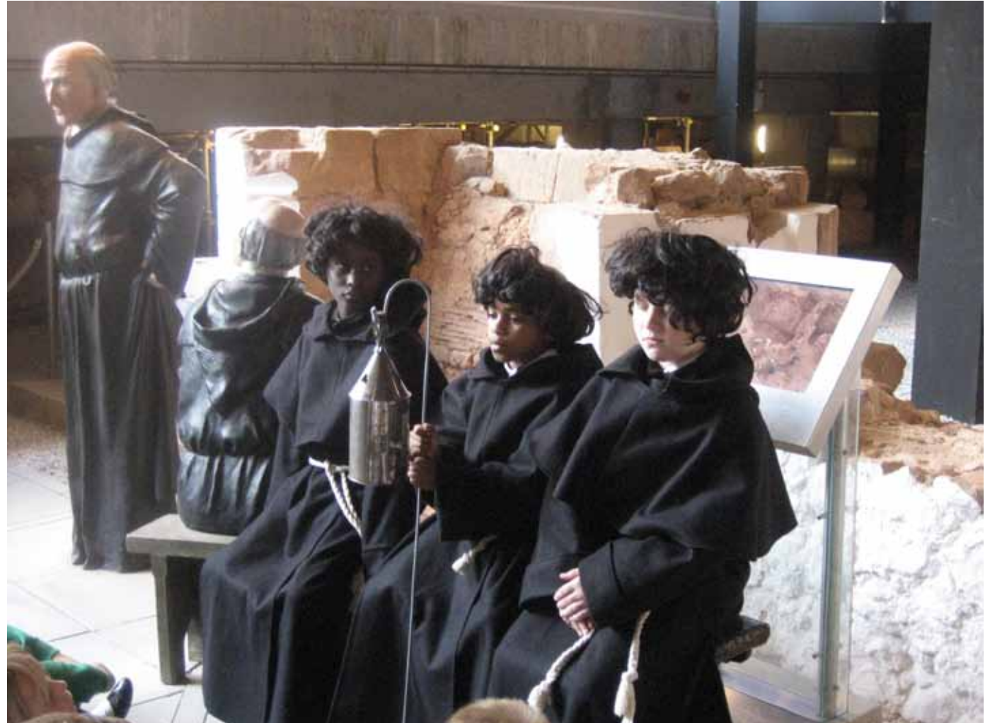
Children dressed as monks in the Priory Undercroft