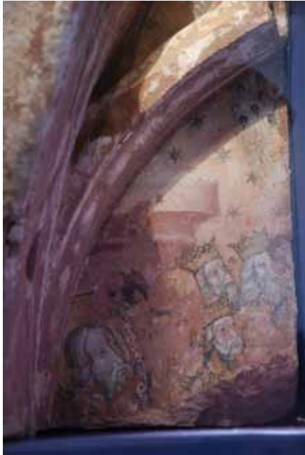
This medieval wall painting depicts the Appocolypse (judgement day)

This can be seen in the Priory Visitor Centre.