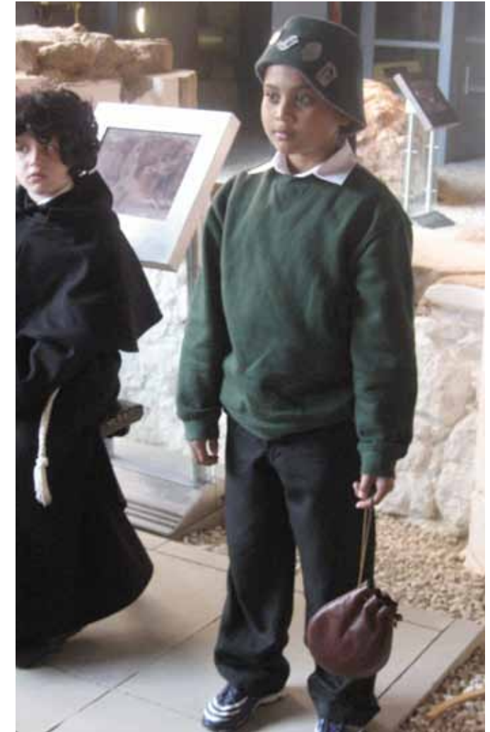
Child wearing a pilgrims hat