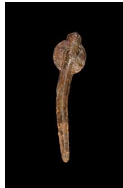
Catherine wheel pilgrim badge

This sword and buckler pilgrim badge is based on a small fist shield (the buckler) and sword. It would most likely have been worn / used by someone in the military.