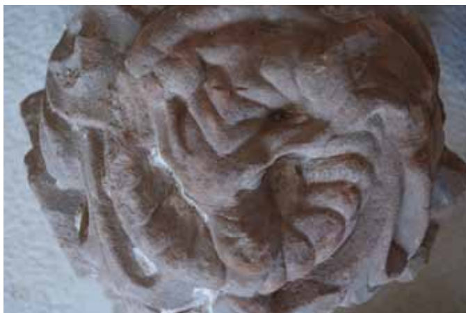
Makers mark on priory wall stone

This roof boss, which would have been part of the roof decoration and therefore intended to be viewed by looking up, shows a curled up dragon.