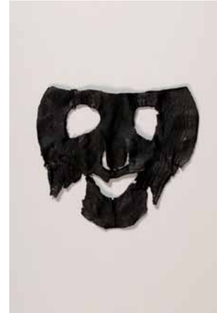
This is a rare surviving leather medieval mystery play mask, which would have been used when performing mystery plays on the streets of Coventry.

This can be seen at the Herbert Art Gallery and Museum in the History Gallery.