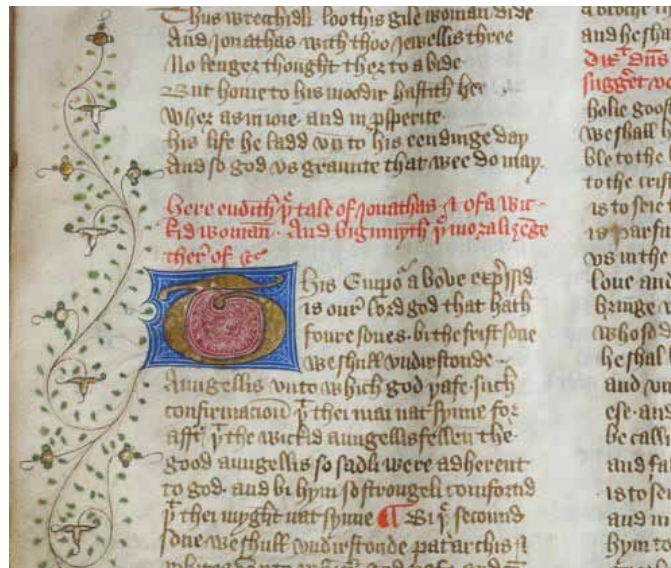
This is an example of illuminated text from Coventry's archives. A lot of illuminated texts were written by monks whose job would have been a scribe.

Medieval wall painting of the Appocolypse